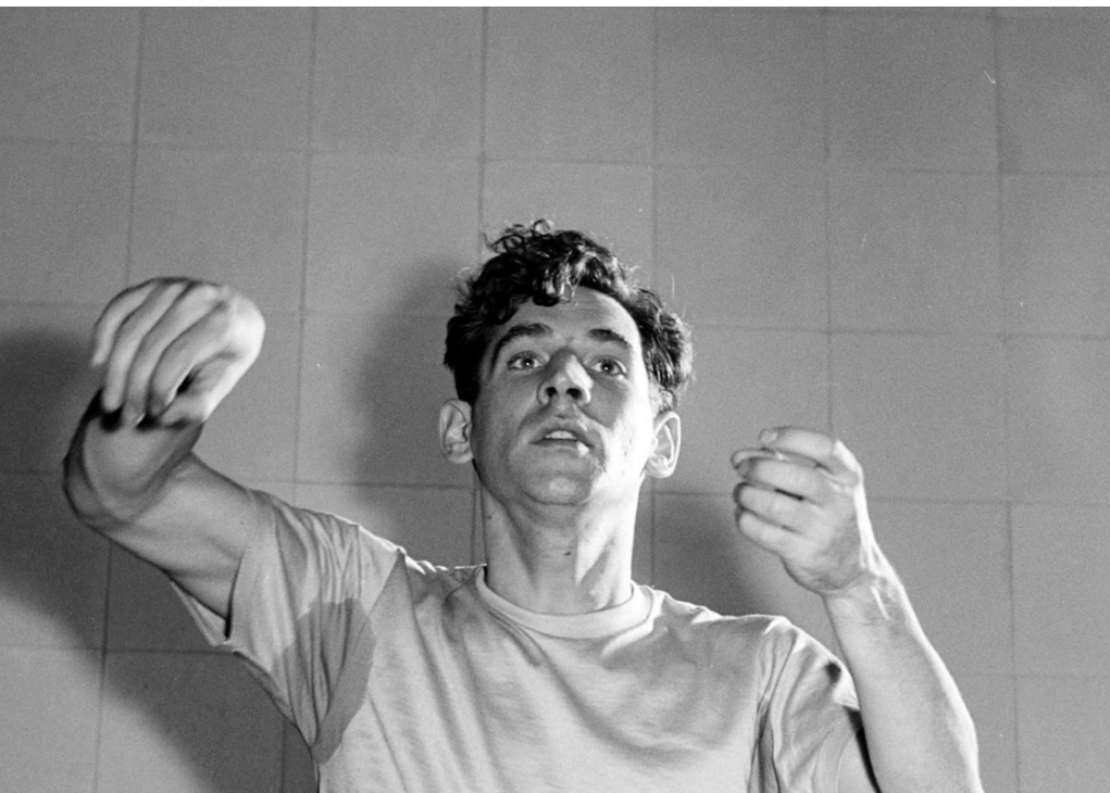
Leonard Bernstein in Carnegie Hall in New York in the late 1940s.

We encourage the students themselves, if possible, to learn and share a brief Bernstein work, so as to give them a more engaged, participatory experience of the presentation